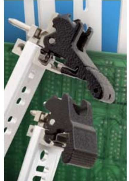
Special care was given to the profile of our aluminum inject / eject handles to ensure conformance to the true U-height requirement even with the handle in the open position

Let Triple E custom build a front panel using one of our all-metal handles that will meet your exact requirements.