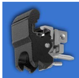
“LT” Style, aluminum