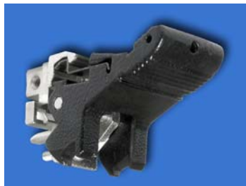
“DT” Style, aluminum