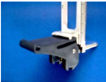
“PT” Style, nylon