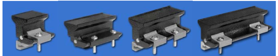
(Twin CAM handles pictured on left and Quad CAM handles pictured on right)

TripleEase™ (VM ) and (VX) Twin and Quad CAM handles have the traditional VME look and may be ordered to support panels up to 16HP (3.2") wide.